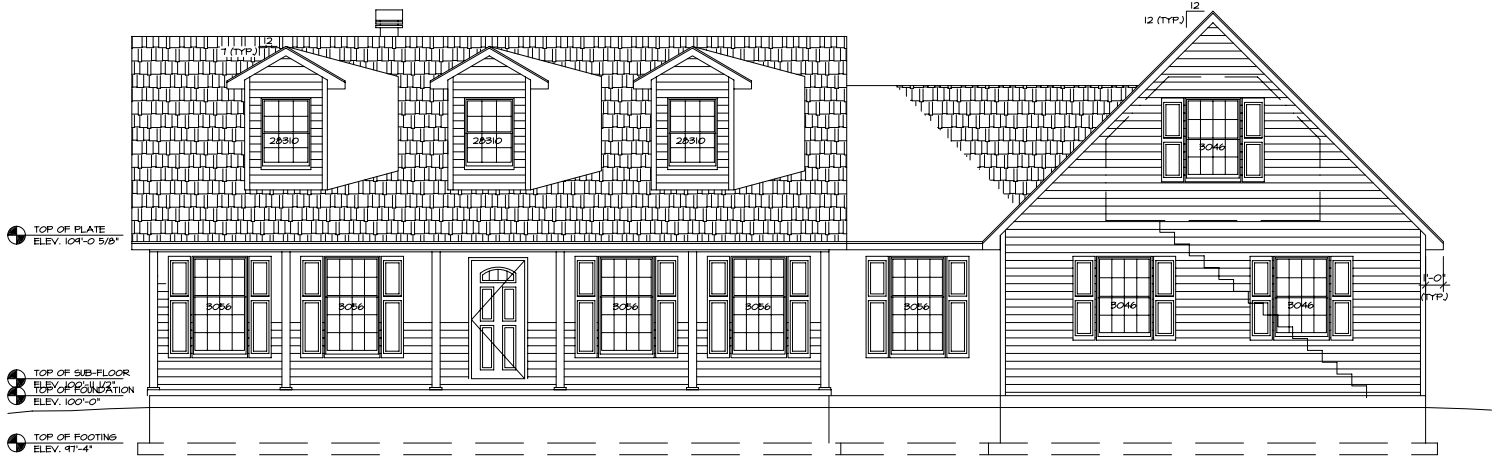
1-1 SOUTHEAST ELEVATION A-1 SCALE: 1/4"=1'-0"